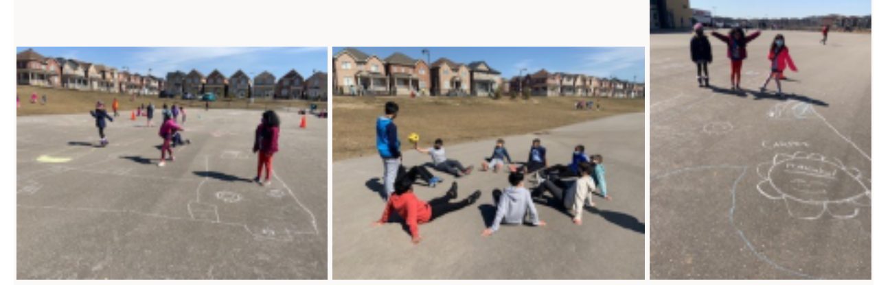
March Madness! Please enjoy the pictures below that highlight some of the special events that took place this week.

The City of Markham has asked that we stay off of the field for the foreseeable future to protect the grass during the spring thaw. This has prompted us to re-do our recess and lunch schedule to ensure that all students get outside two times a day. We are now using the kiss n ride and bus areas at morning recess for our older cohorts. At lunch we have divided the time outside in half with our primary division eating from 12-12:30 and going outside from 12:30 to 1:00. Our junior and intermediate classes go outside for the first half of the lunch hour and then come inside to eat for the second half. This new schedule allows us to stay in cohorts but also get outside.